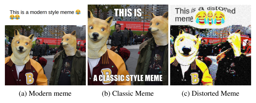
Figure 3: Three examples of the different meme styles

the image representation (4096) is much larger than the linguistic one (768), so it has the capacity to encode more information. Also, the different models have different number of parameters due to different MLP input and we didn't take into consideration this variation of the model's capacity. Secondly, we think there might a visual bias on the dataset. Mainly, because there are more modern style memes on the no hate class and more classic style memes in the hate class. Classic or modern memes refer basically to the format and placement of the text. Figure 3 (a) and (b) are examples of them. Also, we found some false positives in the hate class and there might be false negatives in the non-hate Reddit set. Finally, memes are often highly compressed images with an important level of distortion. This fact may affect the quality of the OCR recognition and, therefore, the language encoding, as shown in the Figure 3 (c).